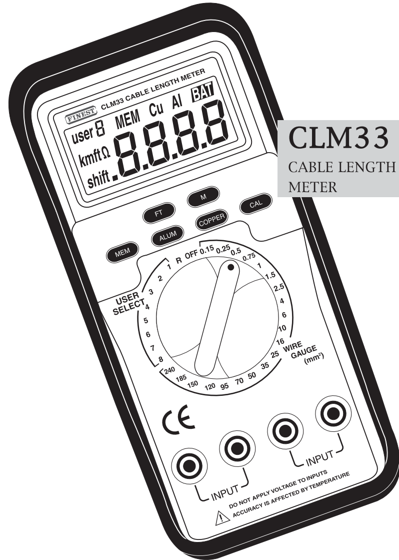
CLM33 CABLE LENGTH METER

FINEST ® a world leader in test & measurement